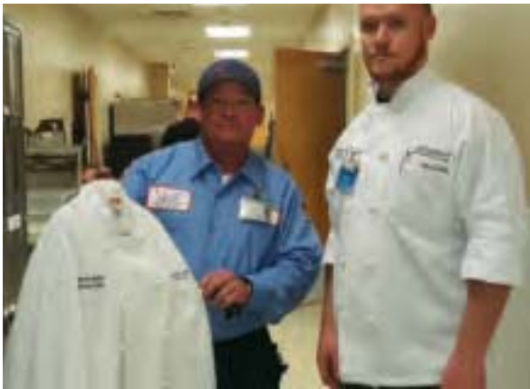
Mazatzal's chefs wear the 10 button chefs coat and look great!