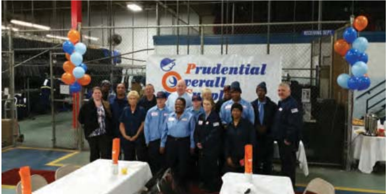
Colonial Heights had a kick-off celebration with a catered breakfast, pictures, and Prudential promotional giveaways. Finally....HAPPY NEW POS UNIFORMED EMPLOYEES AND CUSTOMERS!!

Prudential Overall Supply, an industry leader in supplying image work apparel and related textiles, today announced that it has finalized the acquisition of two Southeast locations from Coyne Textile Services. The acquisition expands Prudential's industrial laundry rental service locations into five additional states: Georgia, North Carolina, South Carolina, Virginia and West Virginia. Prudential's service territory will also reach into Alabama, Maryland and Washington DC.