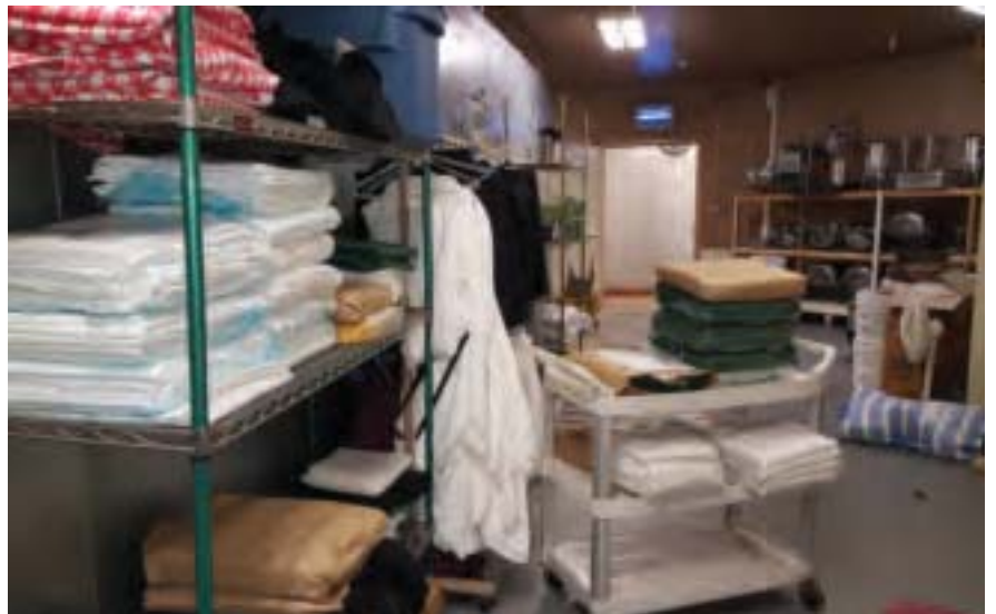
Linens organized nicely in the linen supply room.