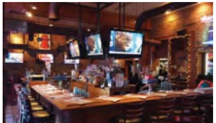
Bar mops are used many times at the bar to clean up those food drink spills.