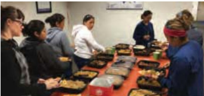
Portland Cleanroom Plant Went 300 Days Incident Free! Great Job!