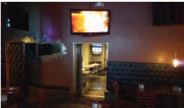
Custom floor mats when entering another area at the bar.