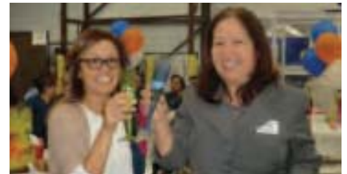
Safety luncheon at the Milpitas Cleanroom Plant celebrating 365 days without an incident. Way to go S.P.A.R.K. Safety Committee!