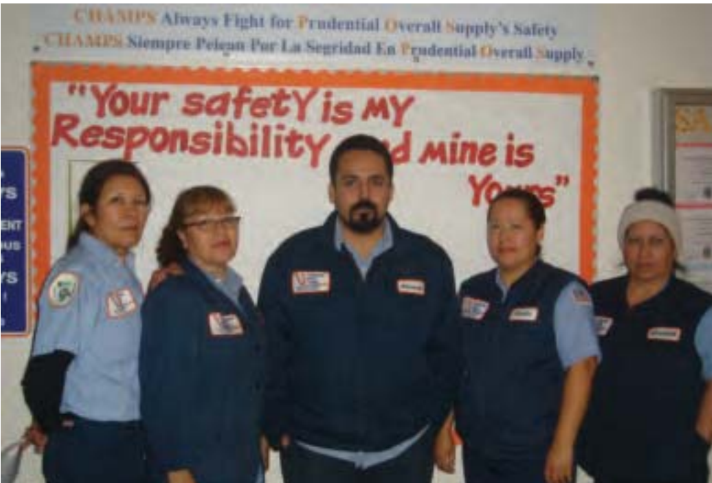
Phoenix Plant C.H.A.M.P.S. Team L-R