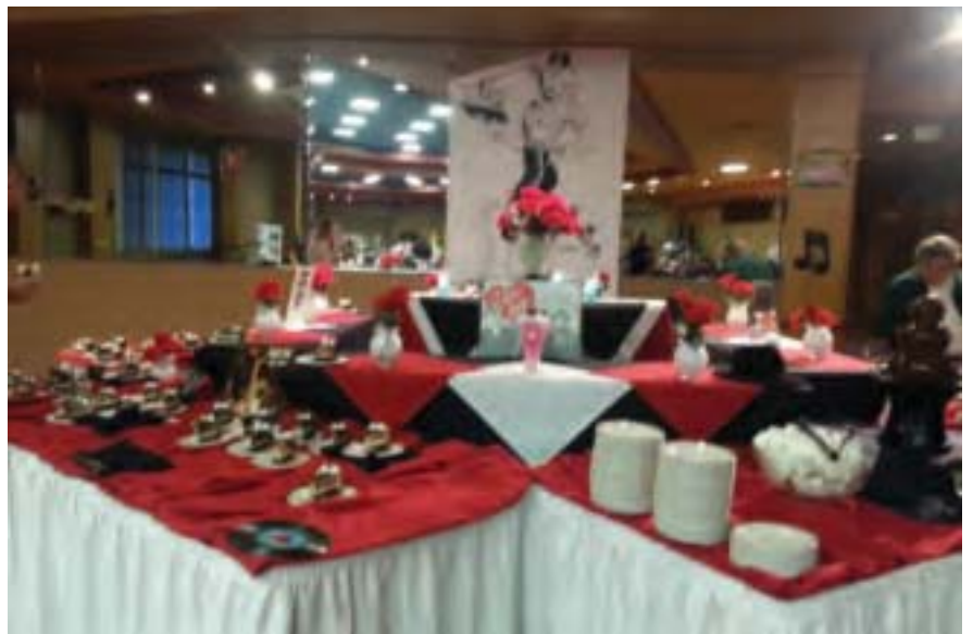
Beautifully presented banquet table using Prudential linens.

Director of Shipping & Receiving, Mazatzal