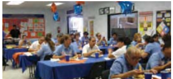
Tucson Plant Went 180 Days Incident Free! Better Than Last Year!