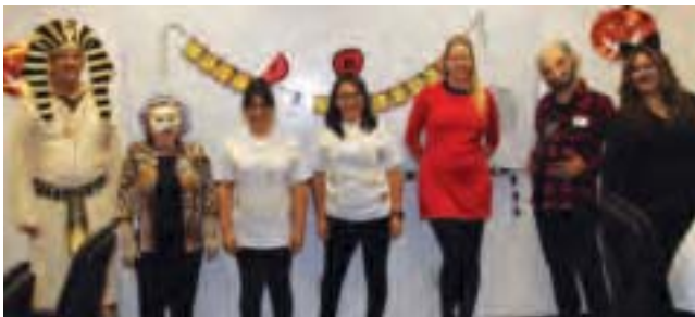
King Tut, Star Trek, Animals, and even a Google Maps system all came to join in on the fun!