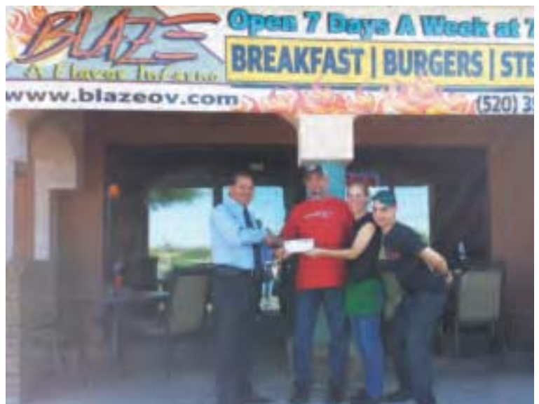
BLAZE under new ownership changes to Prudential services. 10110 North Oracle Road, Tucson, AZ (520) 395-1297