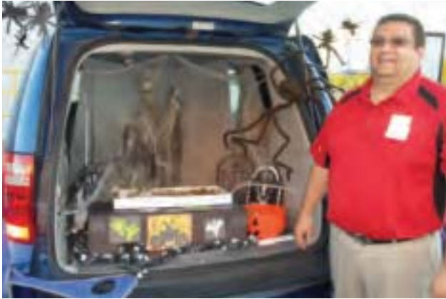
Really into the spirit!