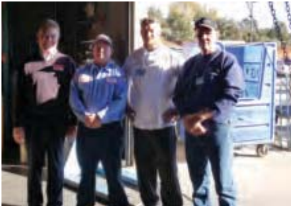
Mazatzal and Prudential team standing proud. L-R