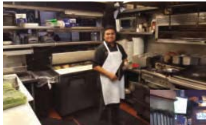
Majerle's employee ready to work in their cook shirts and aprons from Prudential!