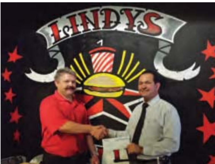
BASHFUL BANDIT now has three accounts with Prudential 3686 E. Speedway Blvd., Tucson, AZ (520) 795-8996