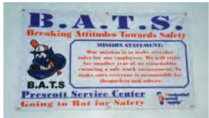
SAFETY PROGRAM BANNER