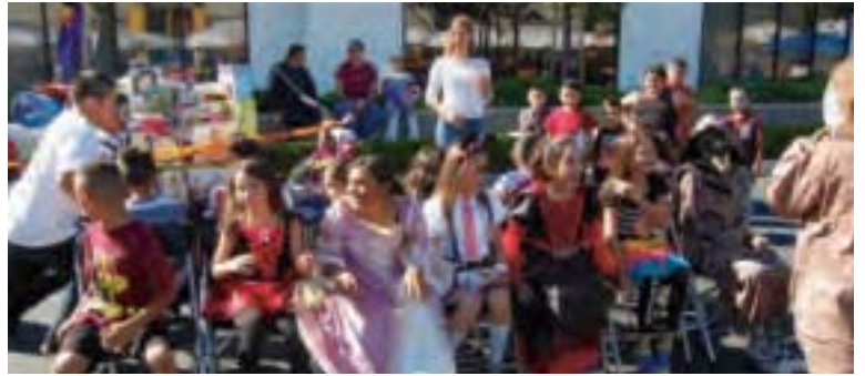
Milpitas Industrial and Cleanroom Plants hold an open house on October 31st. Fun was had by all who joined in all the activities. Family and friends were invited to tour the plants to see what their families and friends do for a living.