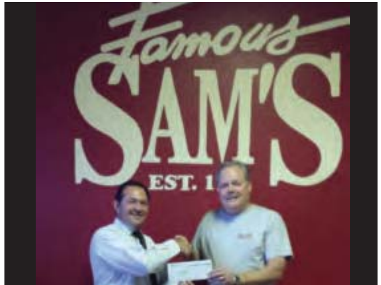
FAMOUS SAM'S was a former customer and now returning to Prudential. 7129 Golf Links Road, Tucson, AZ (520) 296-1245