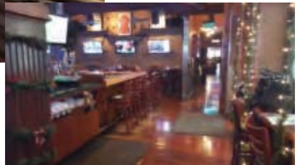
Majerle's places our floor mats in heavy traffic areas to keep the floors clean.