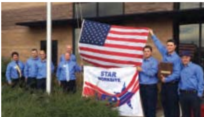
THE B.A.T.S. SAFETY TEAM HANGING THE VPP FLAG L-R

The Arizona Division of Occupational Safety and Health Consultation Department presented Prudential Overall Supply with its VPP Designation on Wednesday, Oct. 28, 2015. See Page 21 for more information and photos of the event.