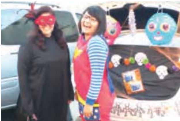
Having fun at the party!