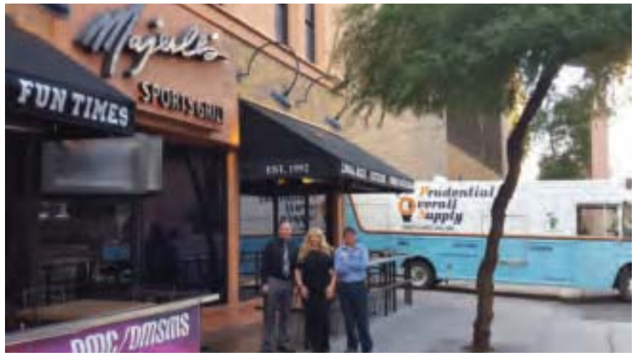
Standing in front of the Downtown Phoenix location.